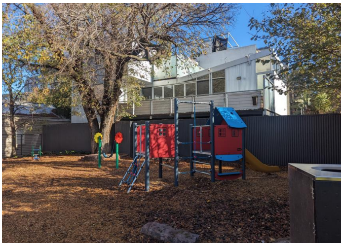
Figure 6 – Pakington Street Reserve