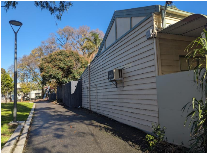
Figure 2 – Subject site 43 Pakington Street St Kilda