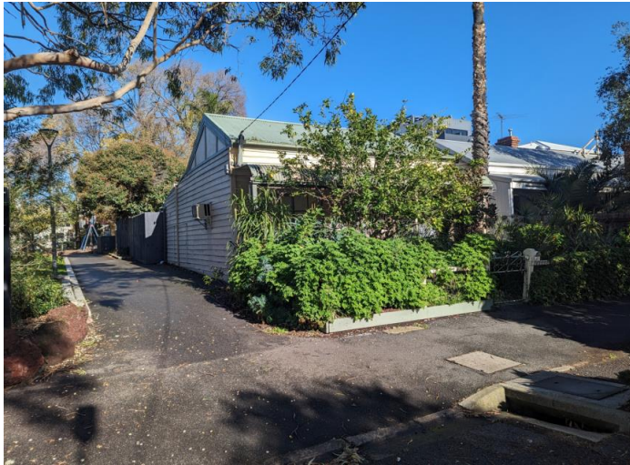
Figure 1 – Subject site 43 Pakington Street St Kilda