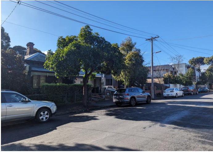
Figure 16 – Views to the east