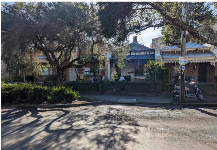
Figure 12 – Opposite subject site