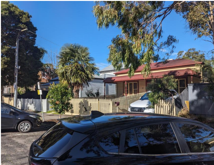
Figure 11 – 49 Pakington Street St Kilda