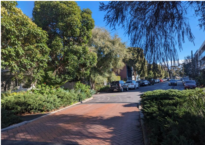
Figure 14 – Views to the west