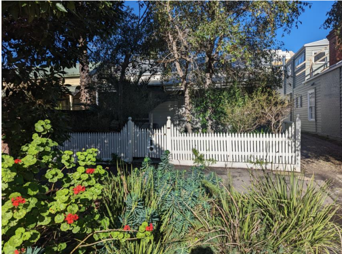
Figure 10 – 41 Pakington Street St Kilda