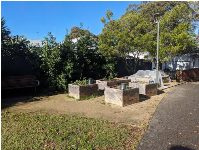
Figure 7 – Pakington Street Reserve