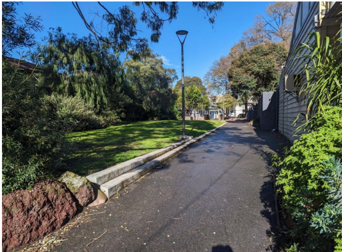
Figure 4 – Pakington Street Reserve