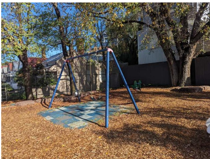
Figure 9 – Pakington Street Reserve