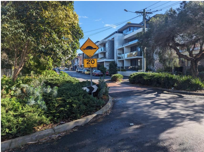
Figure 13 – Views to the west