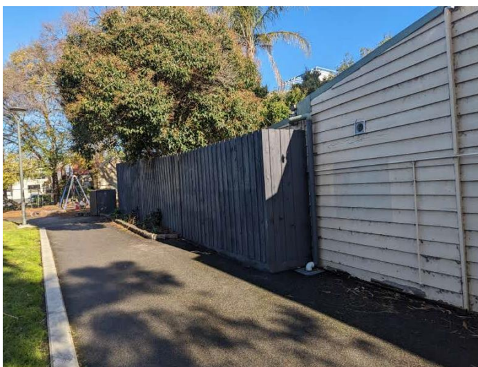
Figure 3 – Subject site 43 Pakington Street St Kilda