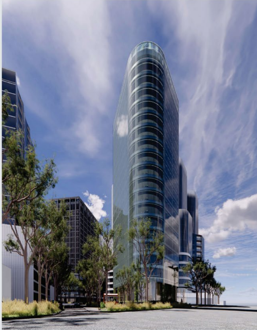
PROPOSED MASSING_VIEW FROM KINGSWAY TOWARDS SOUTH EAST