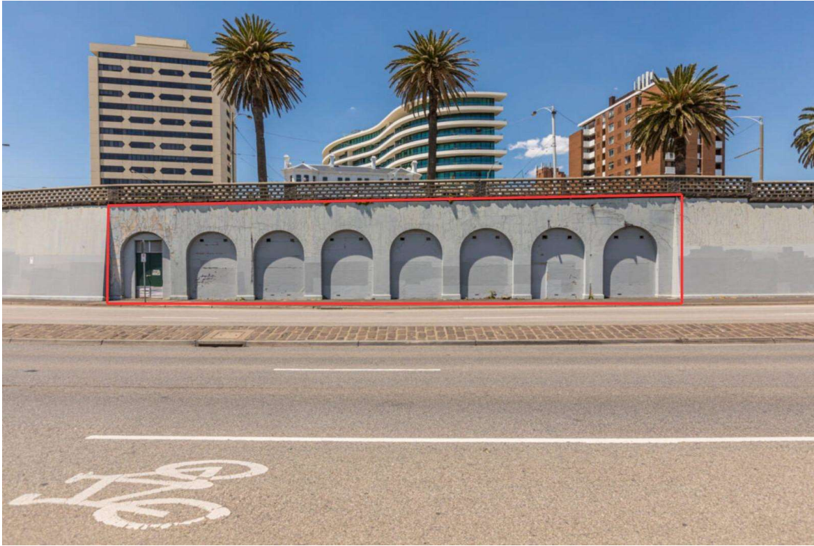
Image: Wall to be painted outlined in red

Work on the site location will need to be completed during business hours. It is the applicant's duty to maintain a safe working environment and immediately report to the City of Port Phillip any issues that may arise on site.