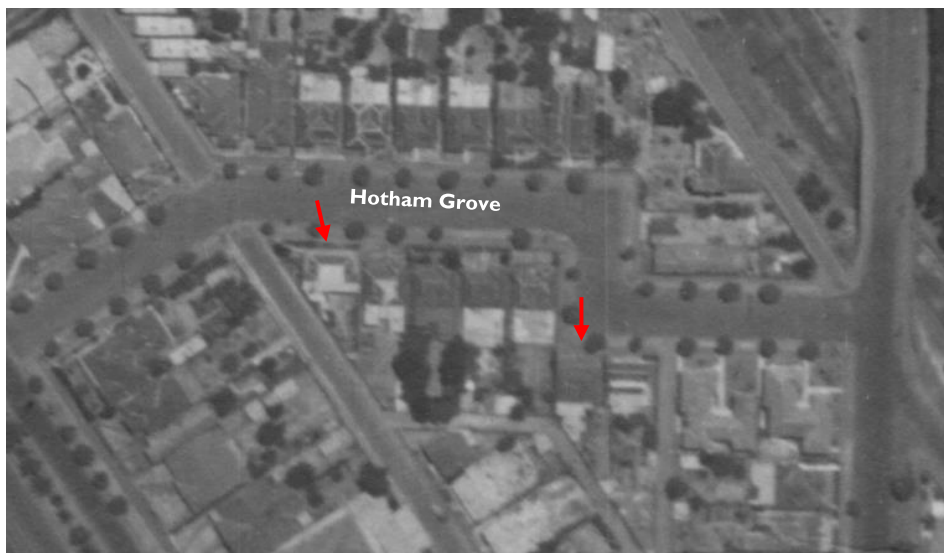
Figure 2 - Aerial photograph dated 1945, showing the subject sites.