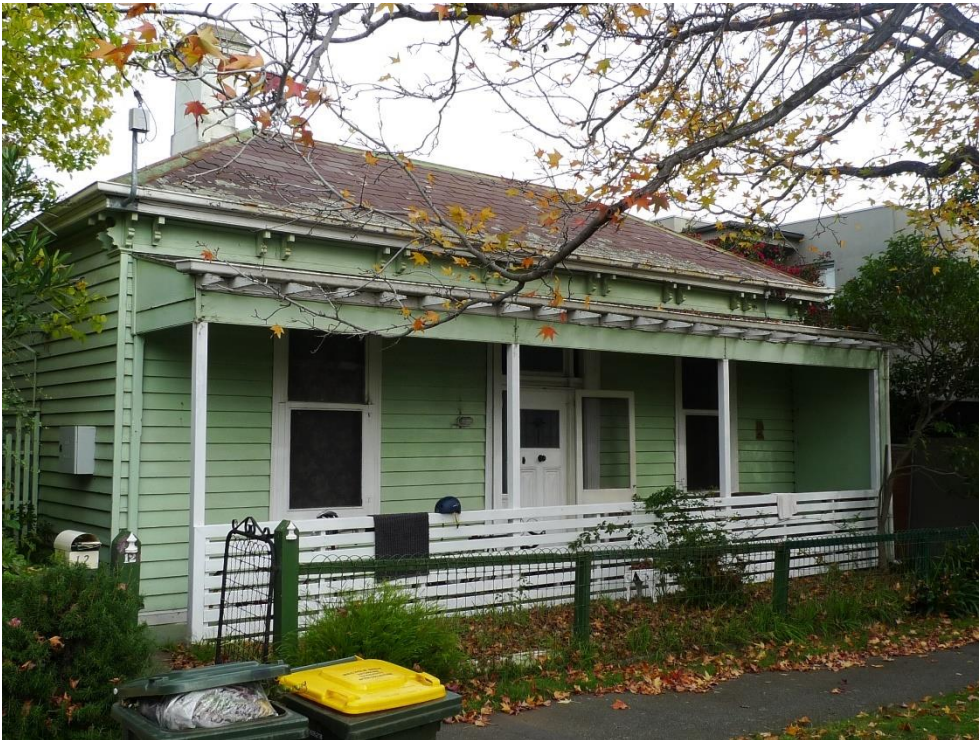
12 Hotham Grove