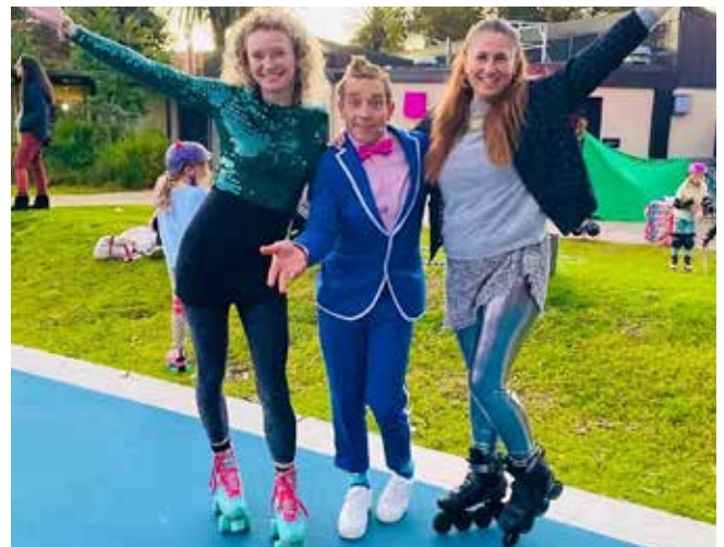
Peanut Butter Roller Jam events to be held between November 2021 and May 2022

Find out more about the successful grant recipients