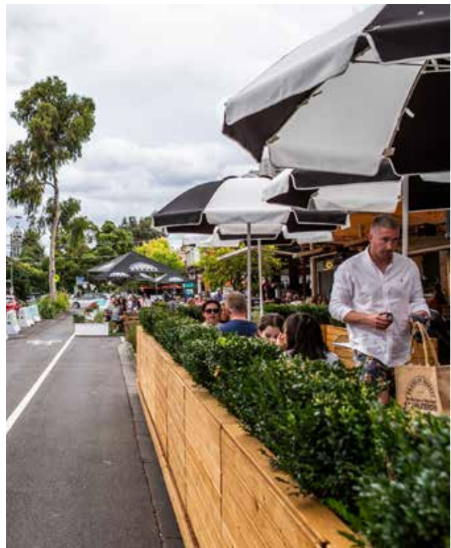
Outdoor dining precinct along Cecil Street.