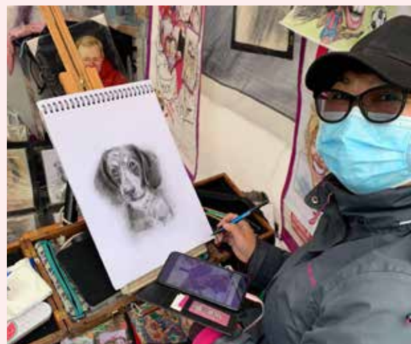
Artist stallholder at the Market