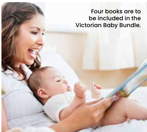
Four books are to be included in the Victorian Baby Bundle.