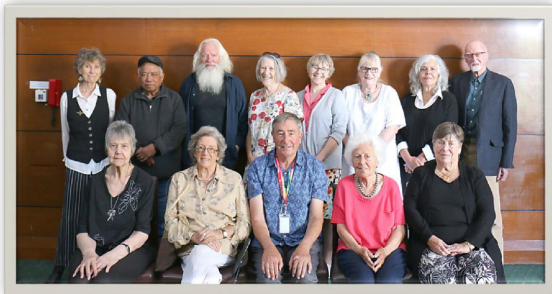
Pictured, OPAC members December 2021.