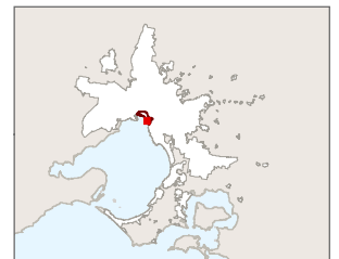
Part of Planning Scheme Map 8