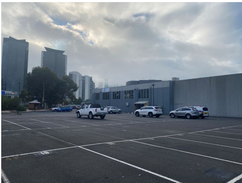
Photograph 13: View looking north and east from 5 Anderson Street towards Lorimer Precinct and the CBD