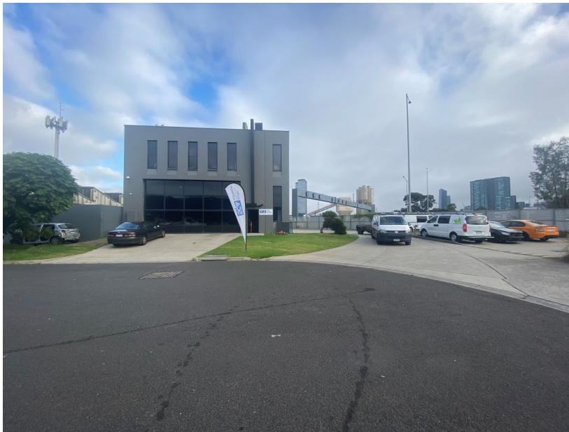
Photograph 10: View looking north along Anderson Street 8 Anderson Street with the West Gate Freeway in the background