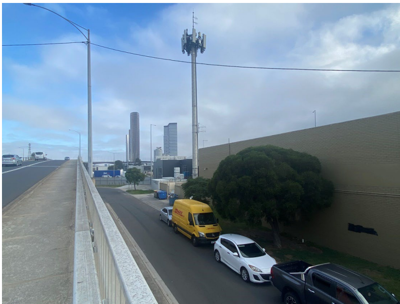
Photograph 17: View looking north along Ingles Street bridge with the subject site in the foreground to the right of the photograph