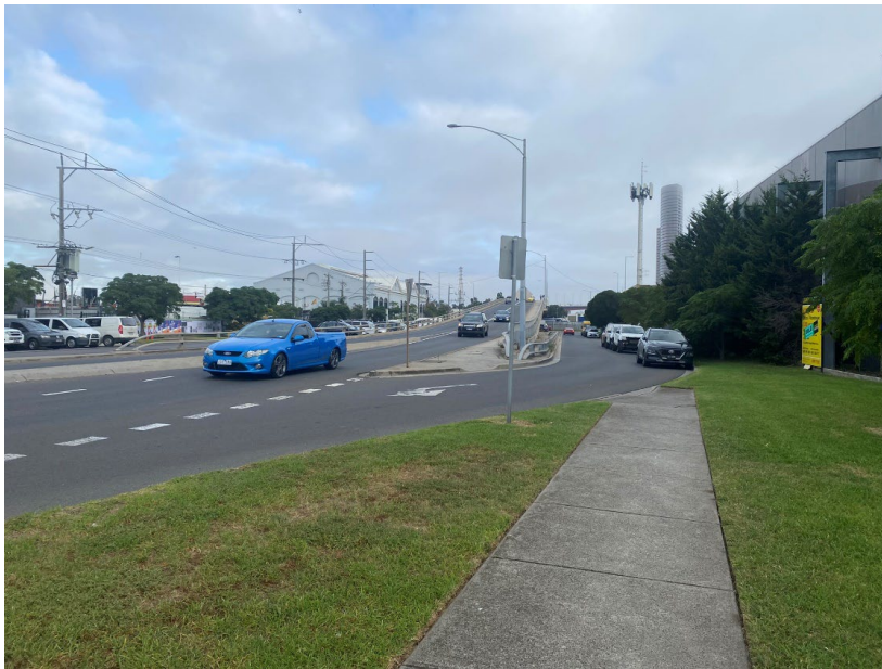
Photograph 14: View looking north-west along Ingles Street