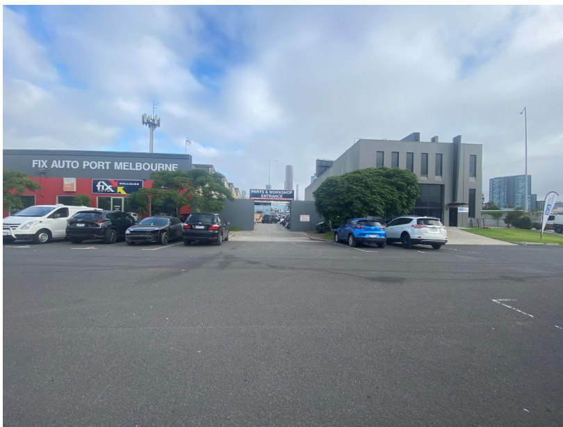
Photograph 9: View looking north along Anderson Street to the subject site and 8 Anderson Street