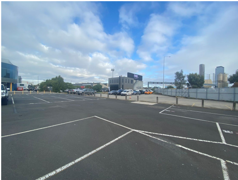
Photograph 12: View looking west from 5 Anderson Street towards the subject site