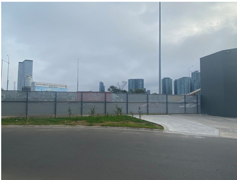
Photograph 5: View looking east from under the Ingles Street bridge towards the West Gate Freeway with high-rise developments in the Lorimer Precinct in the background