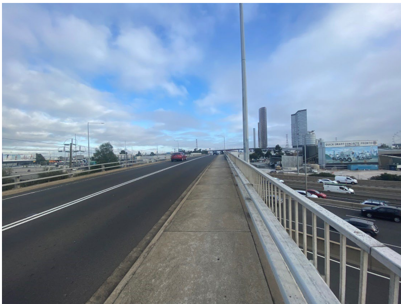
Photograph 19: View looking north-west along Ingles Street bridge towards Lorimer Precinct