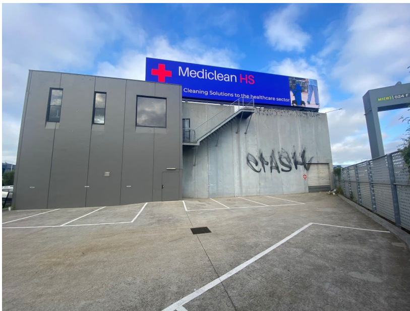
Photograph 11: View looking west toward the side elevation of 8 Anderson Street