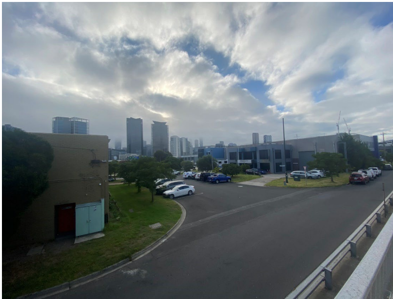
Photograph 16: View looking east from Ingles Street bridge to 1-3 Anderson Street with the CBD in the background