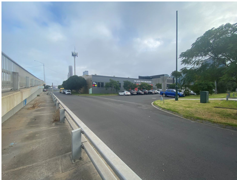
Photograph 1: View looking north-west along Ingles Street with the subject site in the background