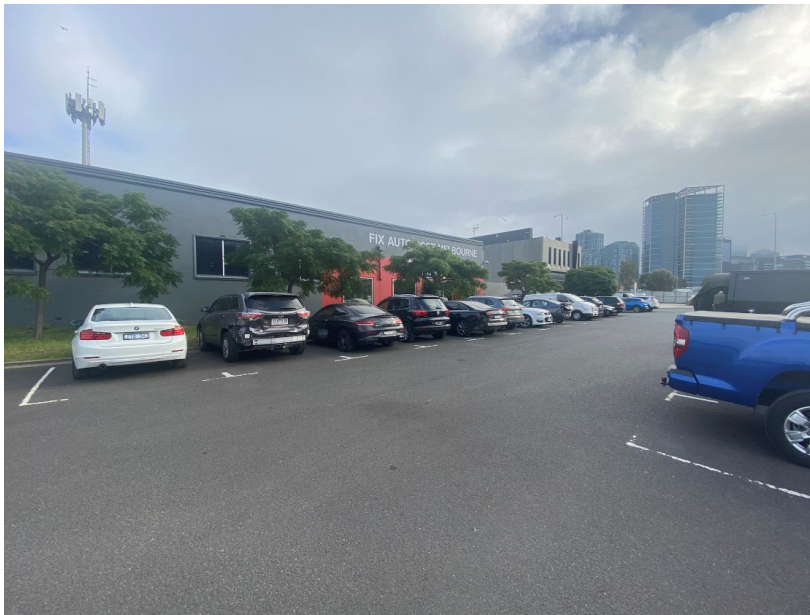
Photograph 8: View looking north along Anderson Street to the subject site