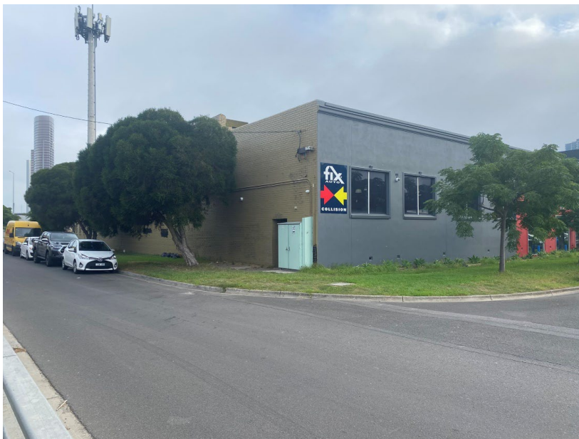
Photograph 3: Corner of the subject site with street trees on the nature strip