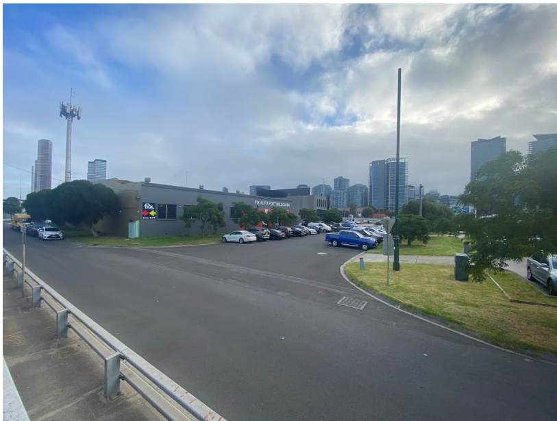
Photograph 15: View looking east from Ingles Street bridge to the subject site