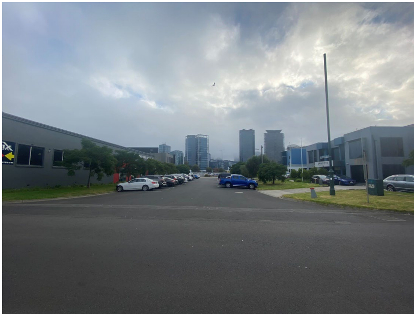
Photograph 2: View looking north-east along Anderson Street with the subject site to the left of the photograph and 1-3 Anderson Street to the right of the photograph