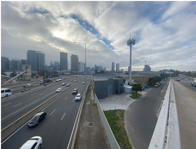
Photograph 18: View from Ingles Street bridge looking east towards the West Gate Freeway to the left of the photograph and the subject site to the right of the photograph