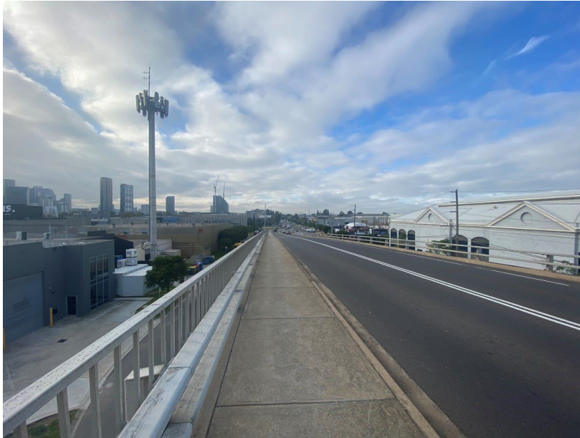
Photograph 20: View looking south along Ingles Street with the parapet of the Former Australian Motor Industries Factory to the right of the photograph