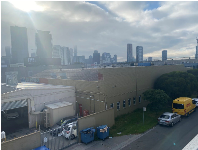
Photograph 22: View from Ingles Street bridge looking east to the subject site