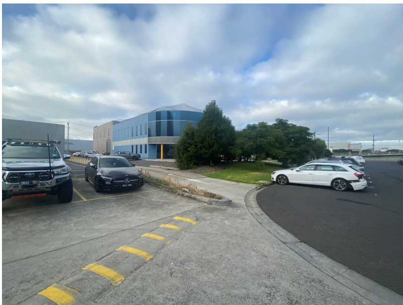
Photograph 23: View looking south from Anderson Street towards 4 Anderson Street