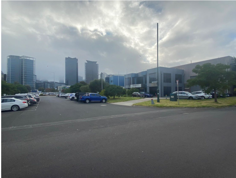
Photograph 6: View looking north-east along Anderson Street with No's 1-3 and 4 to the left of the photograph