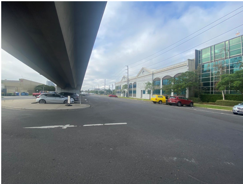
Photograph 21: View from under Ingles Street bridge looking south-east along Ingles Street the Former Australian Motor Industries Factory to the right of the photograph