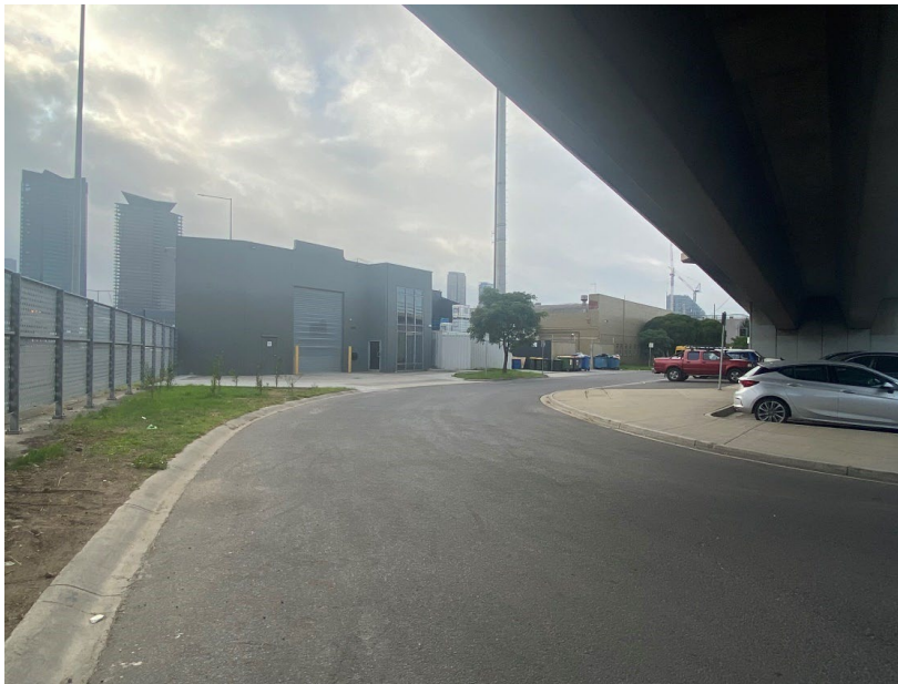
Photograph 4: View looking south-east from under the Ingles Street bridge towards 284A and 284B Ingles Street with the subject site in the background