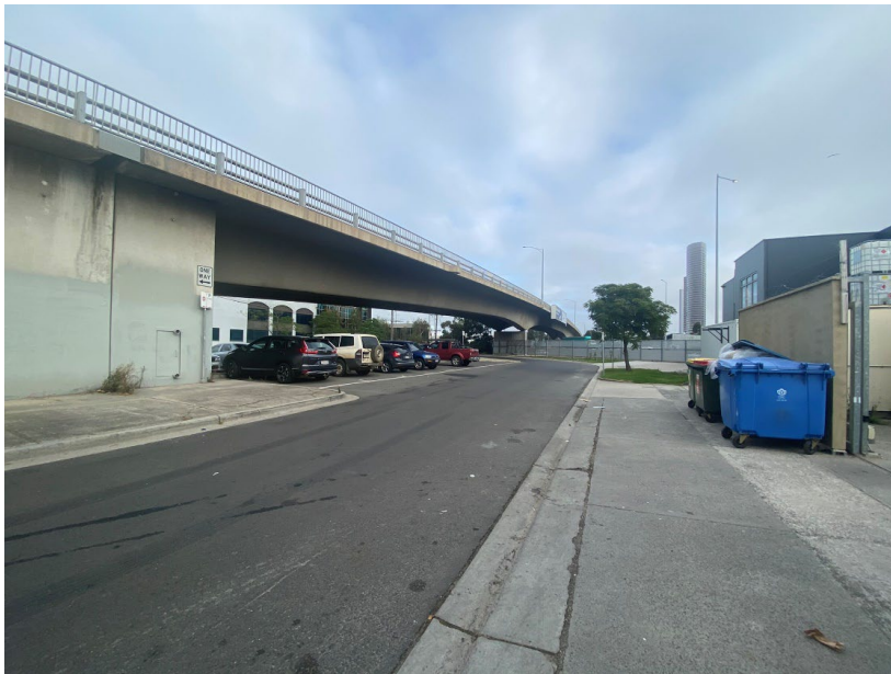
Photograph 7: View looking along Ingles Street with the access to the subject side to the right of the photograph and the Ingles Street bridge to the left of the photograph