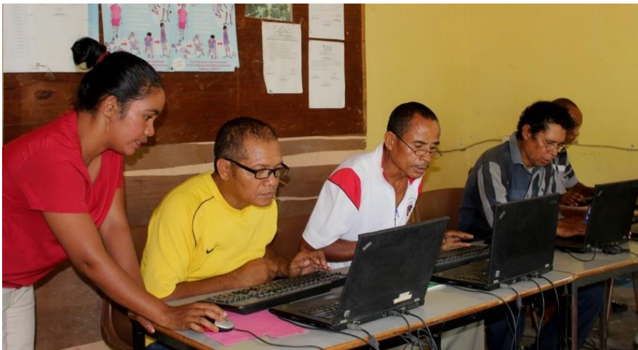
42 Municipal government staff received computer training at the CCC