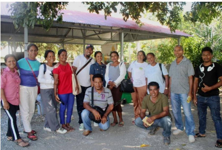
Many community members supported the social audit to improve outcomes for students

This program was completed in December, with the CCC reporting their findings to national government and the local community. This was a pilot program and the CCC were congratulated on their program implementation, reporting and outcomes and has been encouraged to apply again in the future. This work aligns to the CCC key focus areas of education, health and advocacy. There is great community support for this project and it has widespread benefits, as other schools are also encouraged to improve their school lunch programs and improve nutrition for young students.