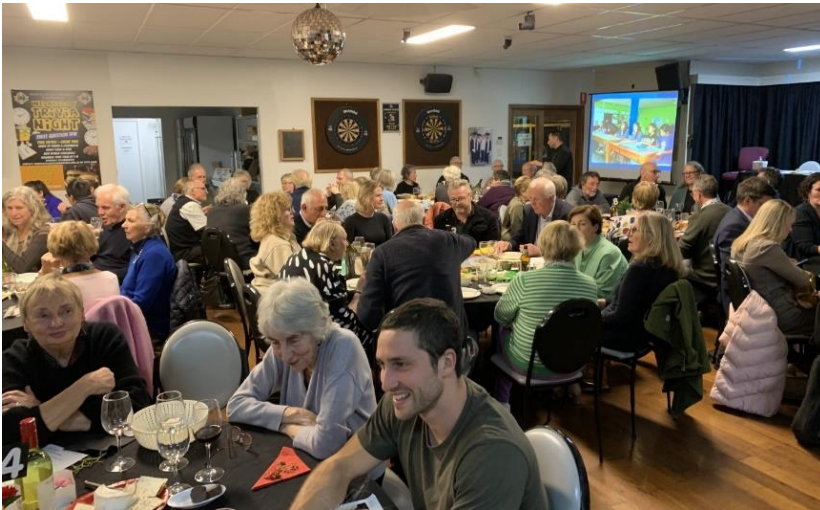
The annual trivia night was a great success and many new and old friends attended