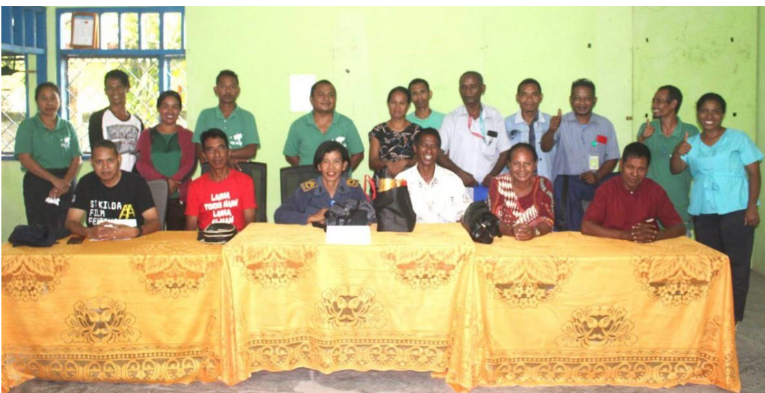
CCC Commission members and senior staff at a meeting in April 2023