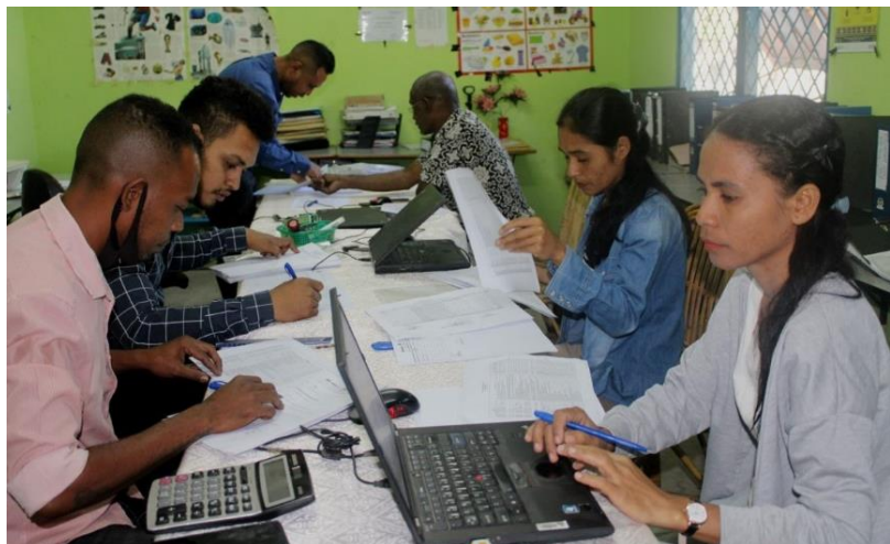
The CCC Finance team working with the external auditors

Each year the CCC is externally audited by CC Business Solutions in Dili. Audits are funded by CCC partners, including the City of Port Phillip. The 2021/22 audit took place in July 2022. The CCC received a clean audit report and recommendations have been implemented.