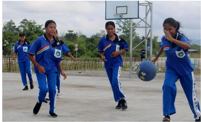
Students at the Suai Secondary School enjoy using the basketball court.

Students enjoy using the basketball court located in the school grounds. The reconstruction of the basketball court, which included a complete resurface, new goal posts, boards and rings, was completed in December 2019, with funds donated to FoSC. Major contributors included Albert Park College students and the Port Phillip Basketball Association.