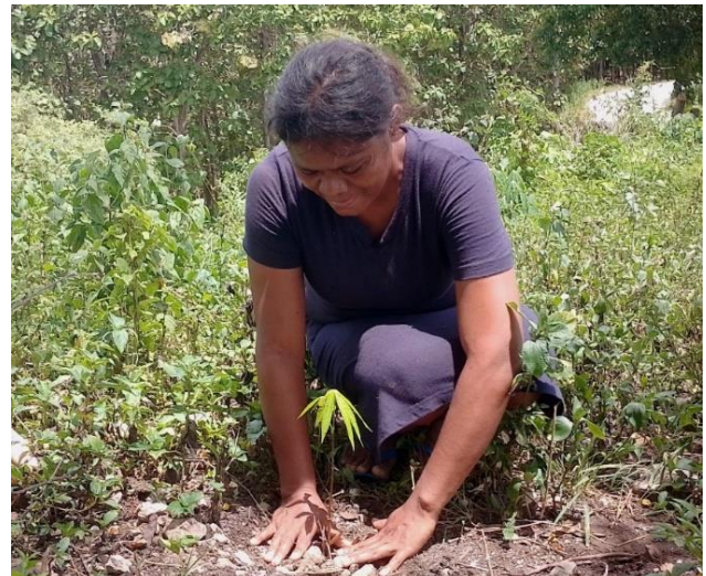
Left: Farmers have ID cards and records are kept of the location and size of all trees planted through the WoS program Right: Trees are planted and maintained by subsistence farming families.