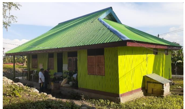
FoSC has continued to support the VPU safehouse in Suai

FoSC is a registered fundraiser with Consumer Affairs Victoria.