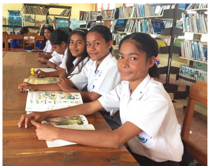
The school library is a great space for students to sit and read.

Last year the two librarians received training from the National Library in Dili to install software to catalogue all the books. The team from Dili is continuing to support the librarians and has also provided donations of books in local dialects to add to the library collection.