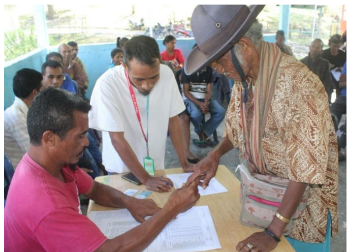
Farmers receive an annual payment of 50c for each tree they are maintaining on their land.

In 2022, FoSC raised the funds for the annual farmer tree payments; with each farmer receiving 50 cents for each surviving tree planted in 2020 and 2021. In 2022, 58 households received payments totalling USD8,348.50 for 16,697 trees, bringing much needed income into these remote villages in Tilomar sub-district. The annual payments this year will be made after June 2023 once the tree count is completed. It is expected that there will more than 45,000 trees, with the payments funded by donations to FoSC and Xpand Foundation.