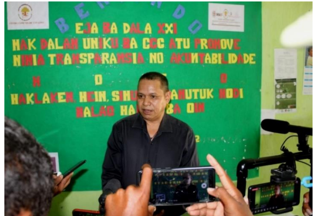
Left: The staff at the CCC enjoy hosting visitors and sharing information about their work