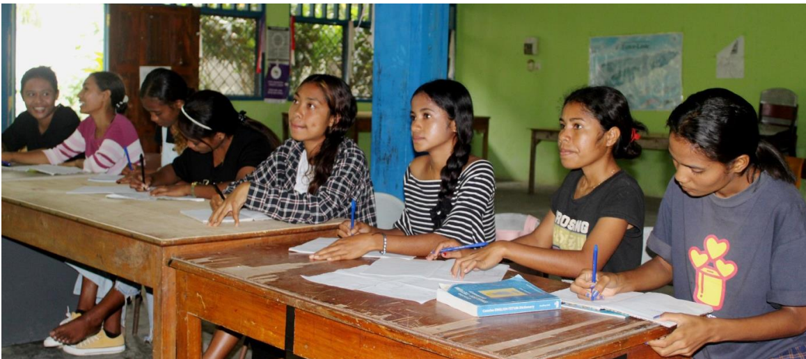
Many young people complete English language training at the CCC in Suai.

FoSC also raised funds this year for an International Women’s Day initiative, to train 15 rural women to develop literacy skills to improve opportunities for village level leadership positions. This training commenced on 21 June and will continue through until July. Outcomes will be reported next year.